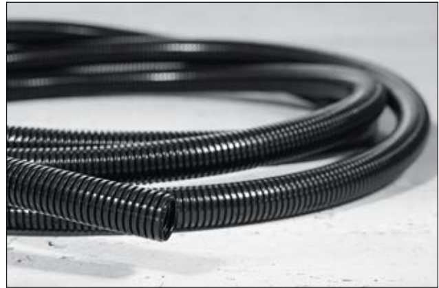
HelaGuard HG-LW is very light and flexibel.