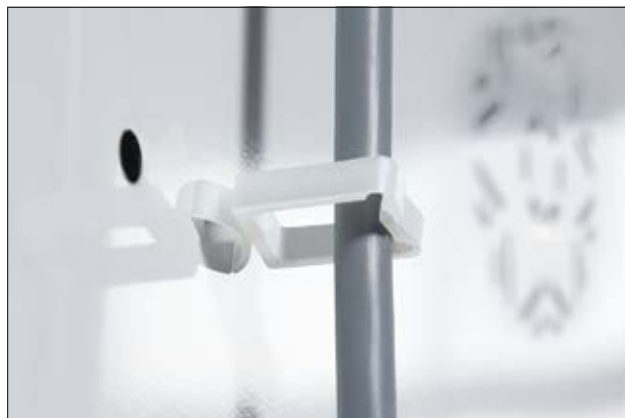
WPC – Wire Push In Clip.