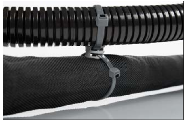
T50RCOUPLER for parallel routing.