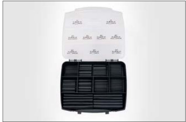
ShrinkKit 321 Basic - 220 pcs 3:1 heat shrink assortment.