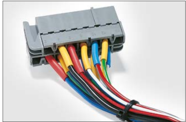
HFT-A conforms to major standards (VG) used in all Defence industries.