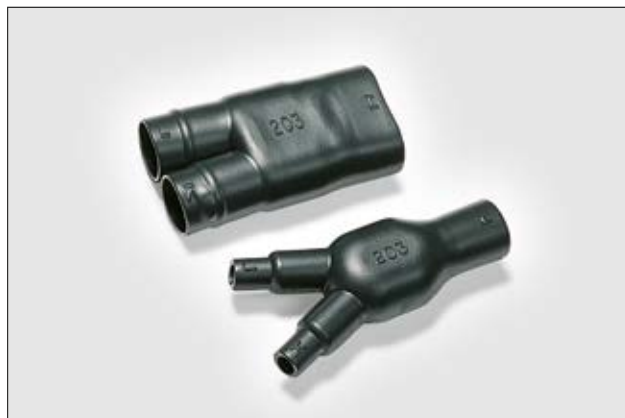
203-1 supplied / fully recovered.