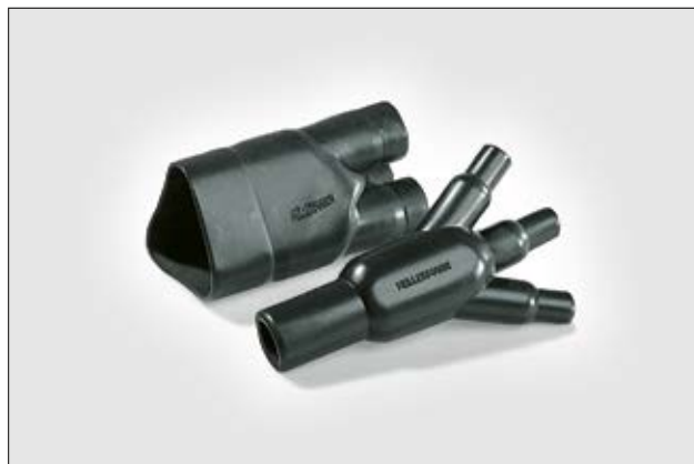
304-1-G supplied / fully recovered.