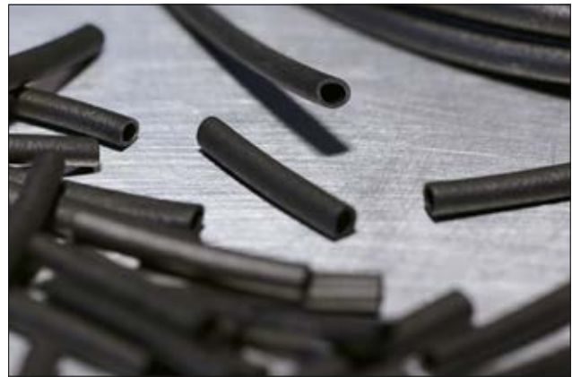
H rubber tubing is highly flexible and easy to apply.