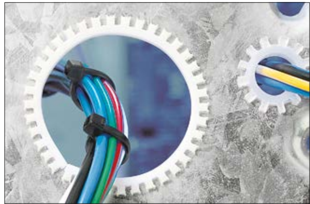
Optimal protection of cables and wires at panel edges.